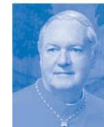
2014 Person of Year His Eminence, Edward Cardinal Egan Archbishop Emeritus of New York