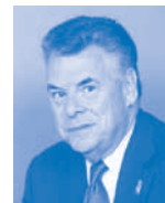
2010 Man of the Year Honorable Peter King U.S. Congressman