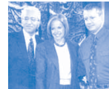
NPDF Legal Defense case profiled on the NBC Today Show.

The NPDF offers (via its member attorneys) a free legal consultation to its members who experience a job related legal problem.