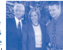
NPDF Legal Defense case profiled on the NBC Today Show.

The NPDF offers (via its member attorneys) a free legal consultation to its members who experience a job related legal problem.